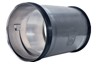
Quick-Lock FLEX for offsets of up to 0.98 inch DN 8" - DN 32"