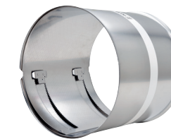
Quick-Lock LinerEnd for attaching hose liners to pipes and structures DN 3.9" - DN 32" (1-part)