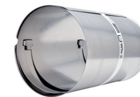
Quick-Lock BRUNNEN for wells and supply lines DN 6" - DN 32"