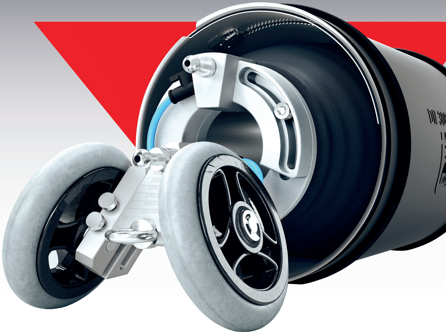
Version 2025_11 Illustrations are similar, subject to errors and technical changes.

The Quick-Lock systems are suitable for rehabilitation in wastewater and industrial sectors, in potable water areas / well rehabilitation, in seawater areas and in pressure pipelines. Customised products available on request. A pressure test in accordance with DIN EN 1610 can be carried out on the entire product range.