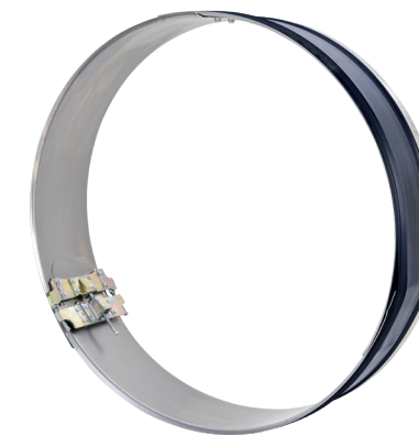
Quick-Lock BIG separable sleeve for rehabilitating accessible pipework systems (multi-part) DN 32" - DN 118"